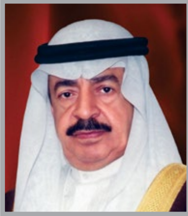
His Royal Highness Prince Khalifa bin Salman Al Khalifa Prime Minister