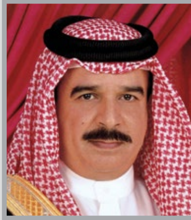
His Majesty King Hamad bin Isa Al Khalifa King of the Kingdom of Bahrain