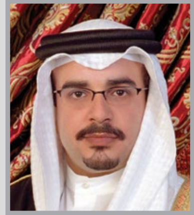
His Royal Highness Prince Salman bin Hamad Al Khalifa Crown Prince, Deputy Supreme Commander and First Deputy Prime Minister